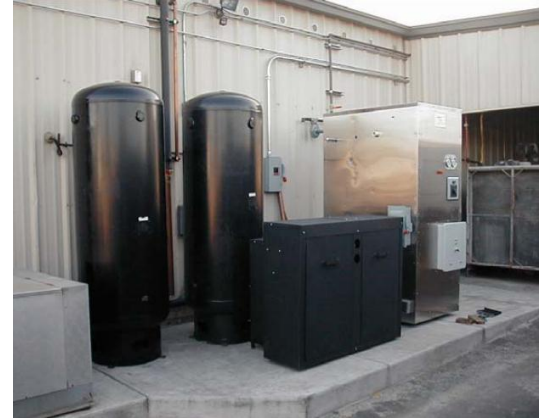
Example Heat Pump Deployment in California

A Chromasun Heat Pump Energy Solution also combines the use of a back-up boiler that while 85% efficient, achieves a 135% efficiency for DHW and 50% efficiency for CHW when combined with the heat pump. This 185% efficiency provides the customer with additional savings when the solar resource is unavailable.